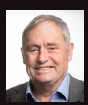
Phil Mauger Mayor of Christchurch

Design your own Open Christchurch weekend and discover your city through architecture.