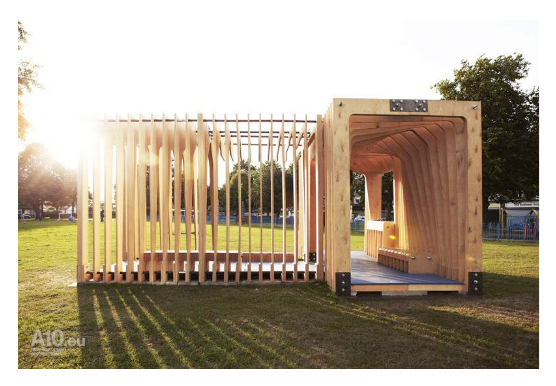
Pavilion, Southend-on-Sea. Cluny Summer Pavilion, Southend-on-Sea Shields