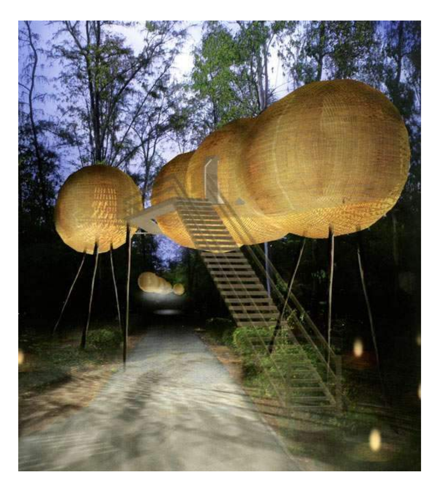
Ewok Tree Houses