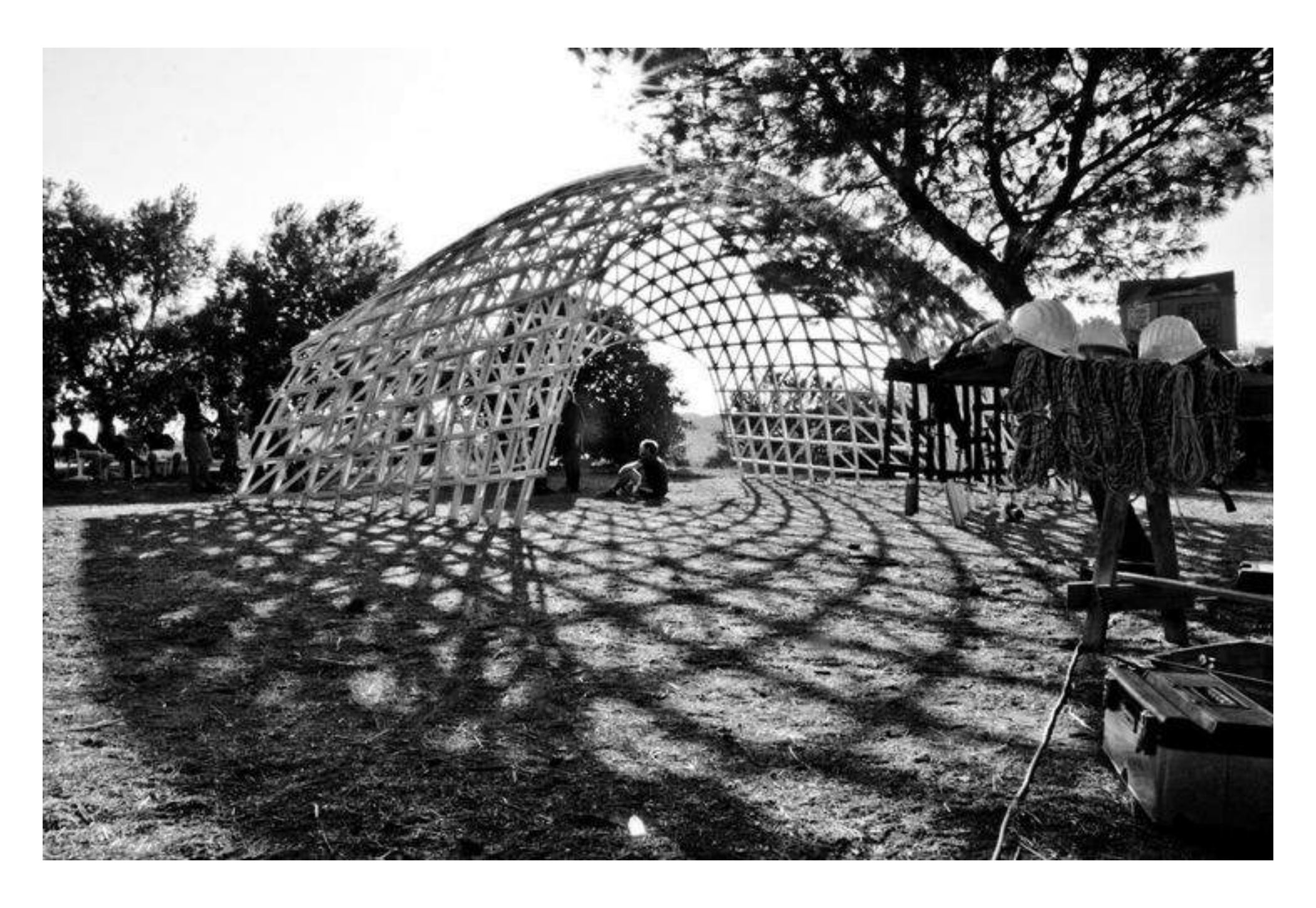
Gridshell Pavillion in the Archeological Park of SELINUNTE - lightweight form resistant wooden structures