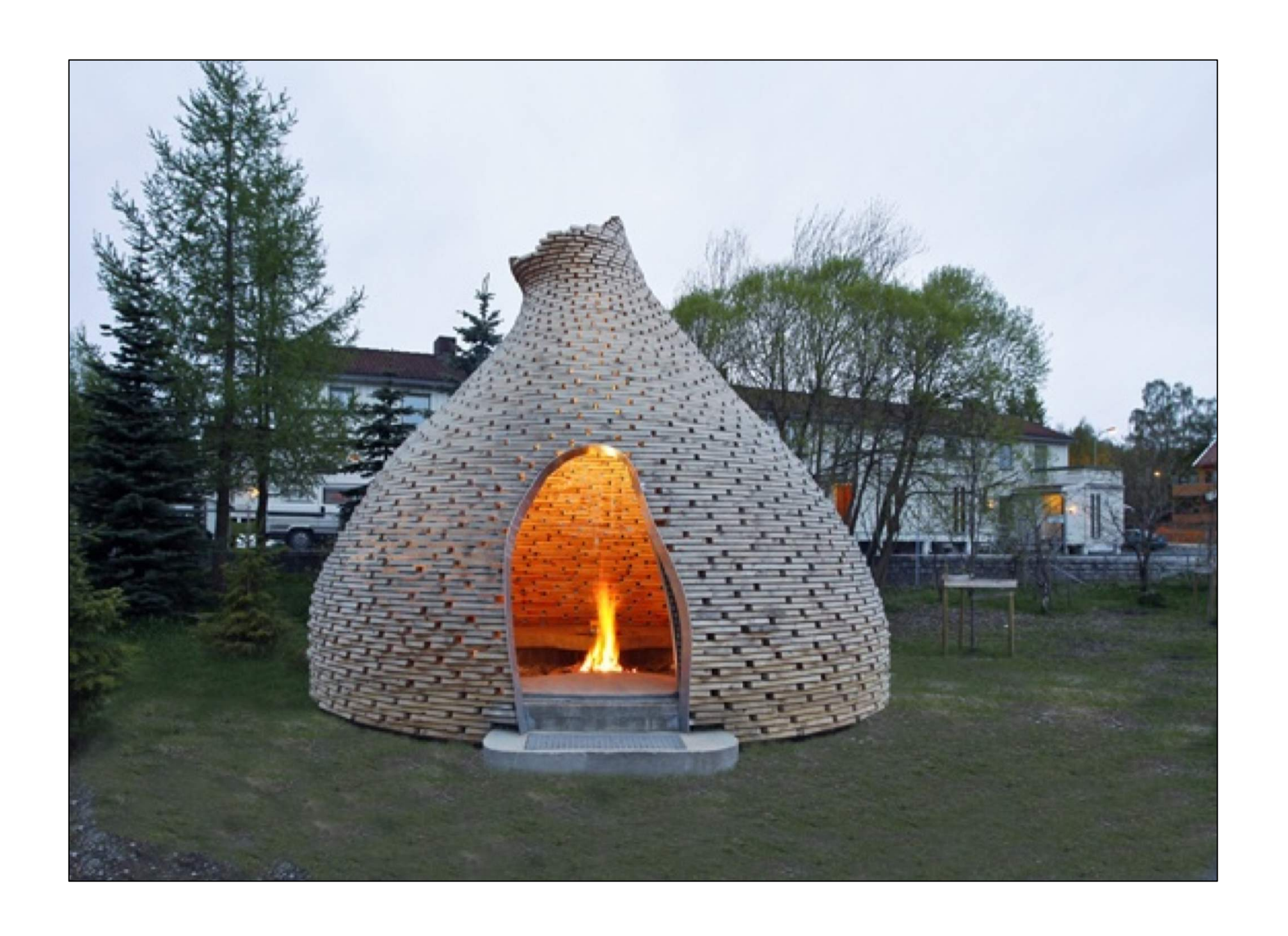
Fireplace For Children, Trondheim, Norway, 2010