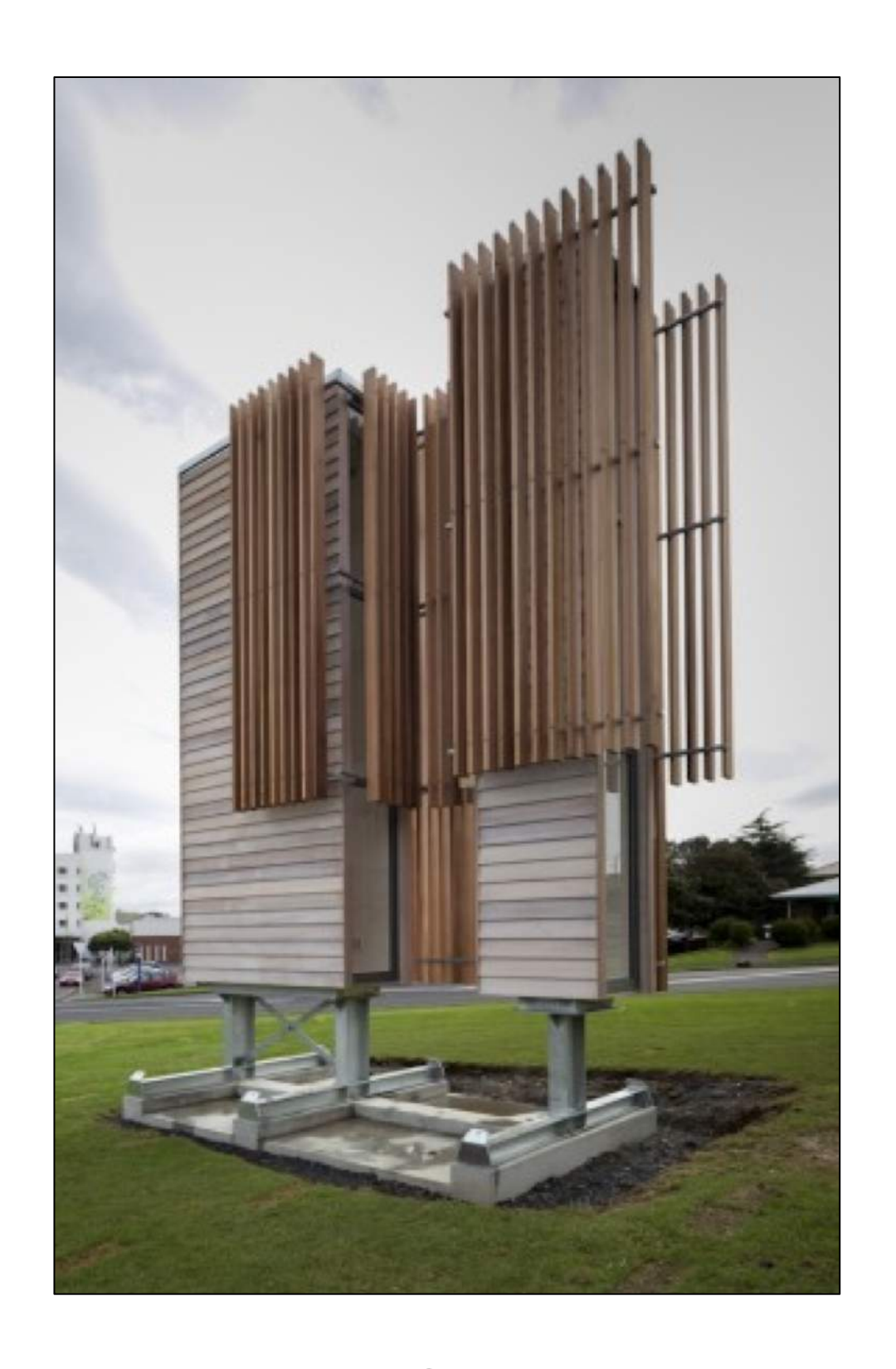
Derrick Cherrie Landshaft 2012 Exhibited at Te Tuhi, Auckland