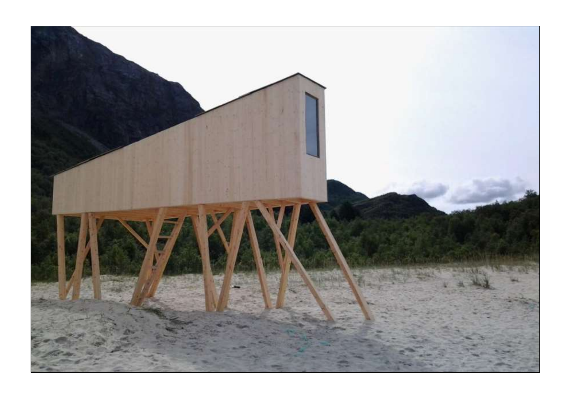
Shelter in Sandhorney, Norway. Created by students for the Salt Festival