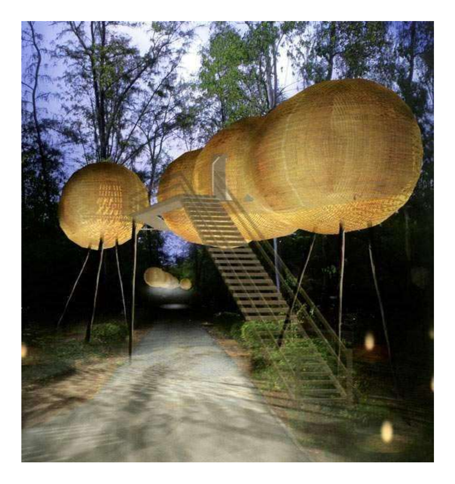
Ewok Tree Houses