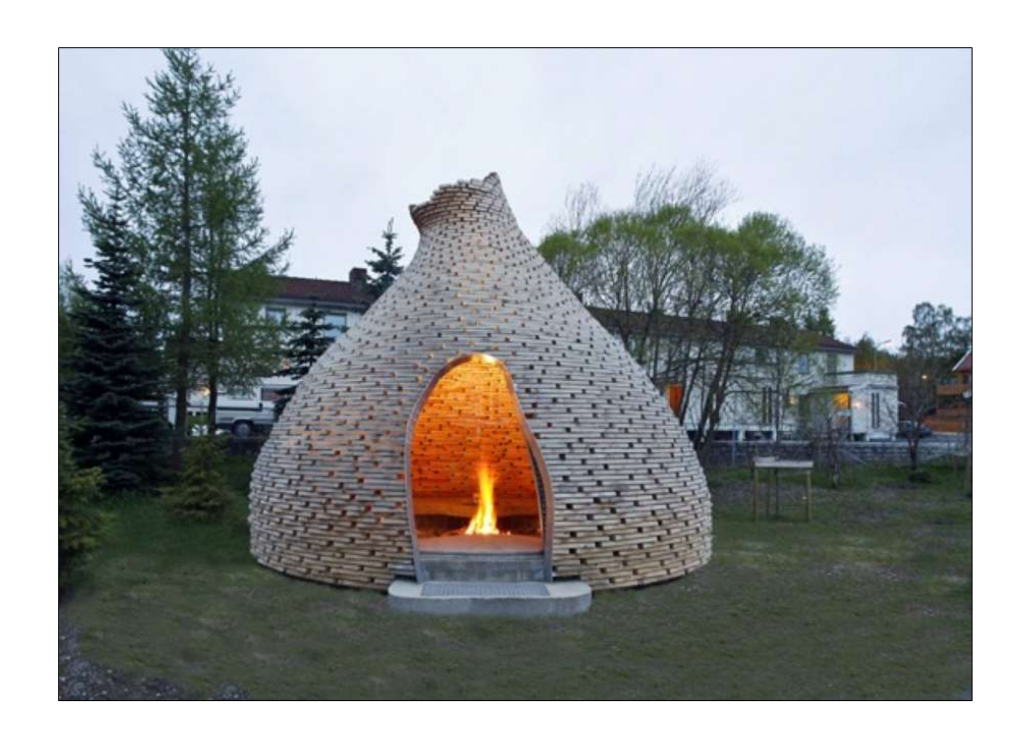
Fireplace For Children, Trondheim, Norway, 2010