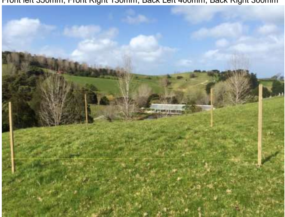
Front left 350mm, Front Right 130mm, Back Left 400mm, Back Right 300mm