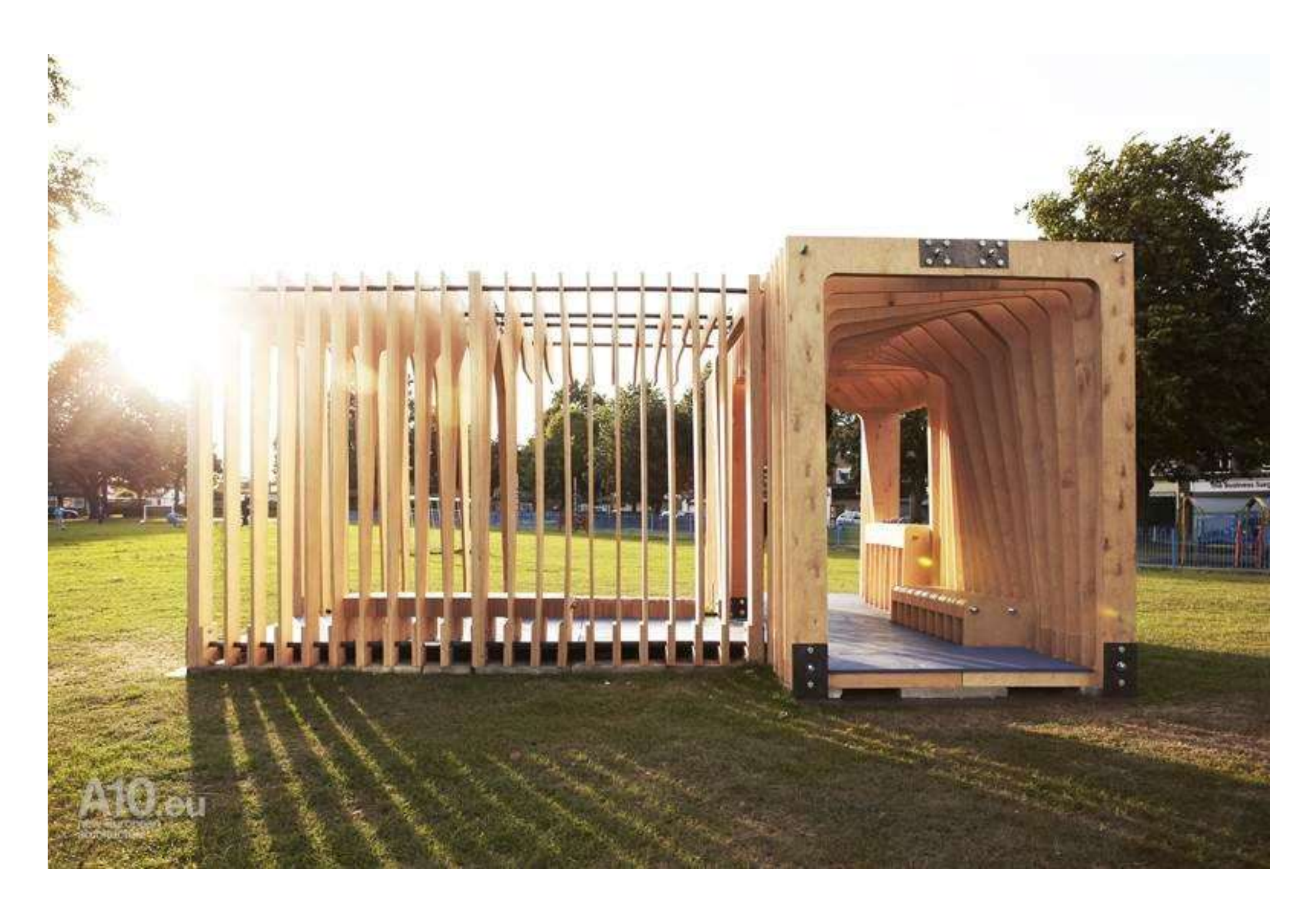
Pavilion, Southend-on-Sea. Cluny Summer Pavilion, Southend-on-Sea Shields