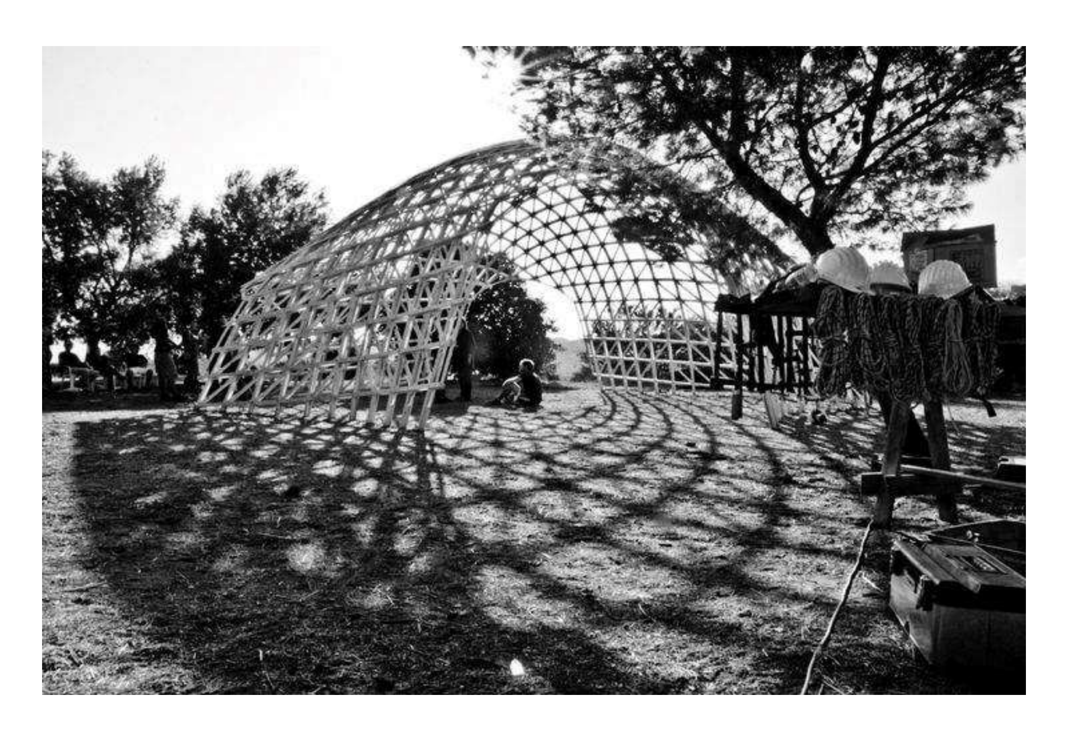
Gridshell Pavillion in the Archeological Park of SELINUNTE - lightweight form resistant wooden structures