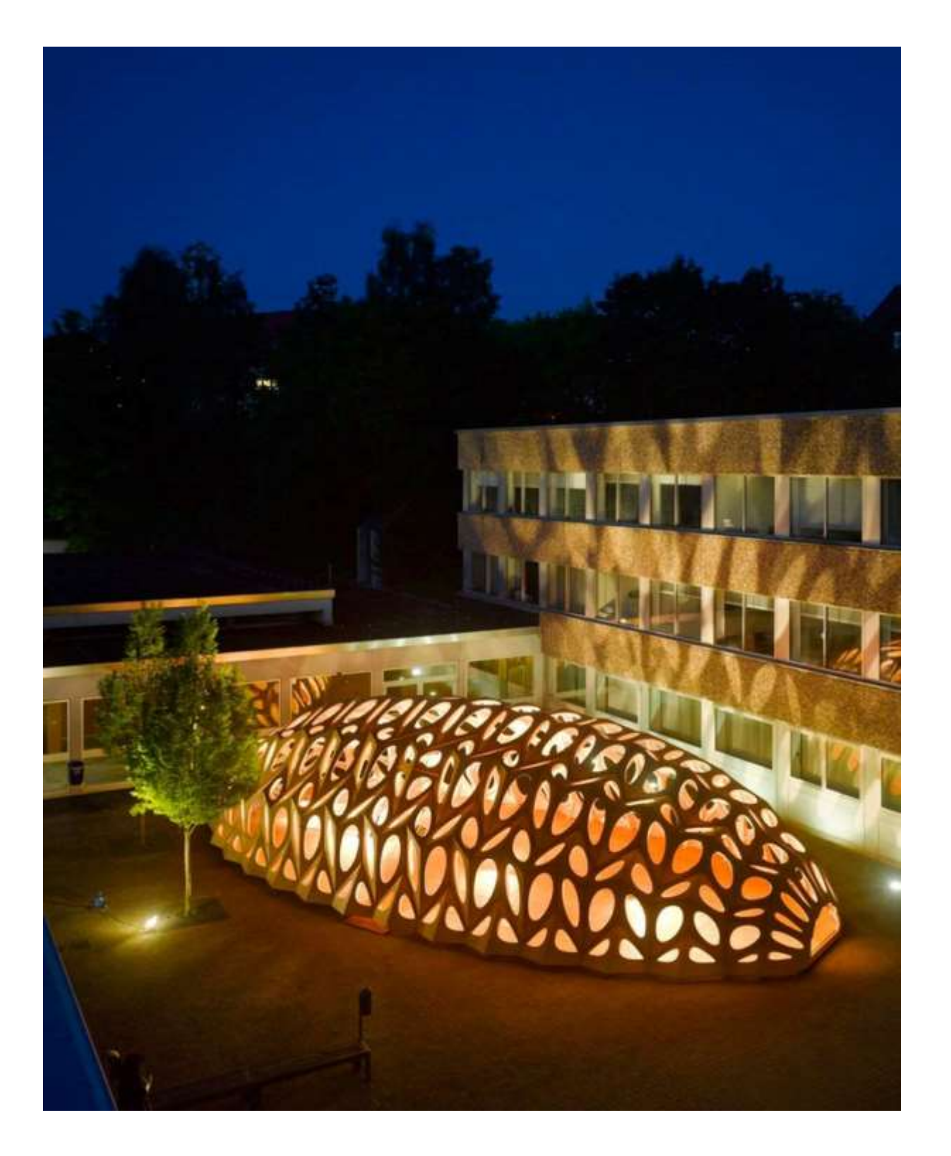
Bowooss SommerPavillion